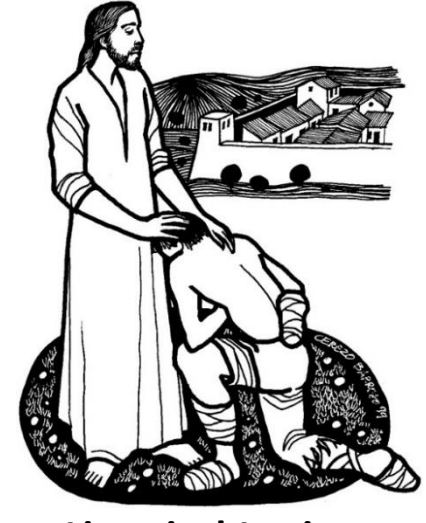
Liturgical Jottings Lent

Lent begins next Wednesday. It is a penitential season of prayer, selfdenial and helping others. In this way the whole church prepares for Easter with those who are to be baptised. Other celebrations in Lent (e.g. Marriage) must take into account of the spirit of penance: musical instruments are only used sustain singing and decorations are very simple.