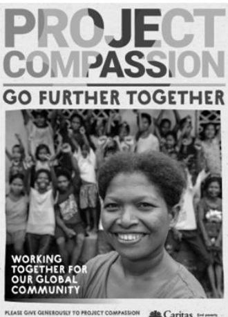
Caritas Give Generously To Project Compassion

a blessed Easter in these times so difficult for all of us. Thank you to those who have already given their support to empower the world's poorest communities to lift themselves out of poverty. But their vulnerability is now so much greater as Coronavirus spreads through these impoverished places. May the hope that Easter brings inspire us to share hope with our most vulnerable sisters and brothers.